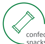
confectionery snacks & bars