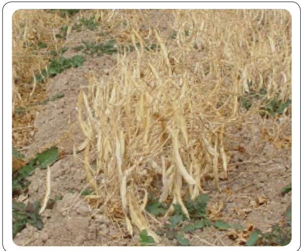
GN 99131 VS. BERYL*

Growing this early maturing proprietary variety can provide a high yielding option for replanting or during a year when a late plant is needed. GN 99131 also typically provides a larger seed size than Beryl without a significant sacrifice in yield.