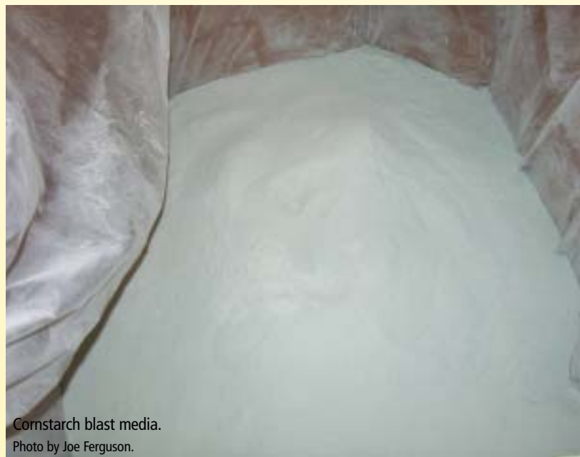
Cornstarch blast media.

The next step of the demonstration was to blast composite components normally processed by sanding. An H-53 engine cowling was blasted with no damage to the fiberglass substrate. (See Figure 1.) An estimated 8-hour sanding job could potentially be replaced with an hour-long abrasive blasting job. Also, corners from raised stringers are not easily accessed with powered sander bits and these areas of the cowling are thinner and more susceptible to damage. Extreme care was taken not to damage the substrate because most of these areas