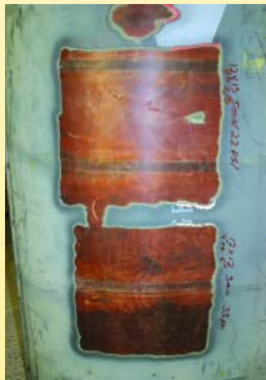
FIGURE 1. Fiberglass H-53 engine cowling.

are resin insufficient or resin-starved. Blasting with eStrip™ GPX media appears to be a viable alternate process to remove paint from these components without inducing damage to the substrate.