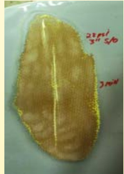
FIGURE 3. Fiberglass AV-8 radome after blasting to reveal suspect damaged areas.

Although not yet approved for use at naval maintenance activities, engineers from NADEP Cherry Point are encouraged by the results of this first demonstration of eStrip™ GPX on naval aircraft components. These preliminary engineering efforts will continue, with the end goal of developing a production friendly process that will not only improve working conditions but also decrease the volume of hazardous waste generated. ⚓