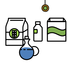
Climate Smart Portfolio Enabling meaningful reductions in corn, wheat, soy, peanut and more to come

Reducing environmental impact and leveraging carbon capture and storage