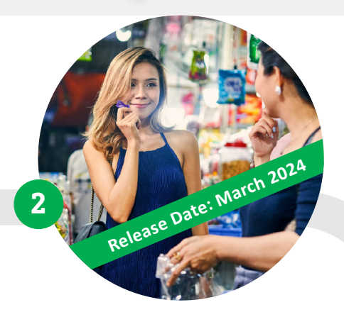
Replacement Isn't the Future. Variety Is.

Expanding food choices to meet lifestyle goals