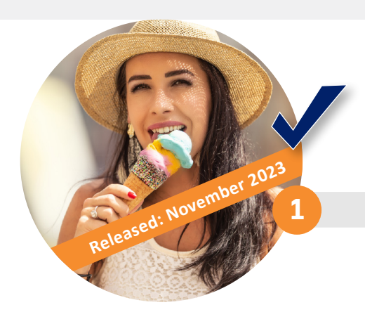
Unapologetic Flavor & Color Experiences.

This is Episode 2: Replacement isn't the Future. Variety Is.