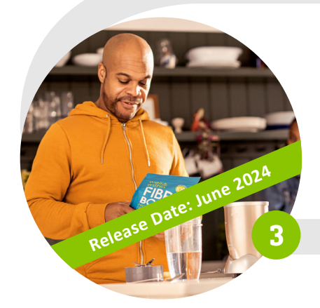
What's For Dinner? Data.

Expanding food choices to meet lifestyle goals