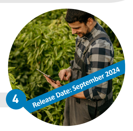
The Next Big Tech Boom? It's on the Farm.

Optimizing everyday personal performance through data